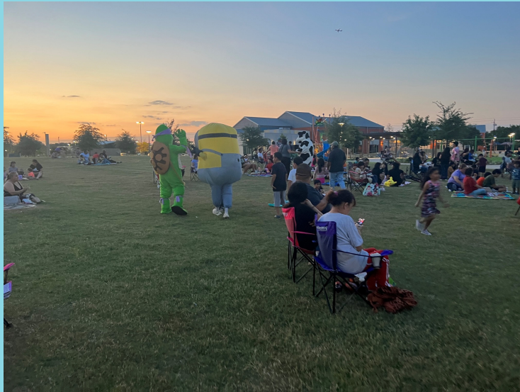
Movie Day Minions, Ninja Turtle and Chick-fil-a Cow

Covert Cameras –The covert cameras are used in the following capacity: